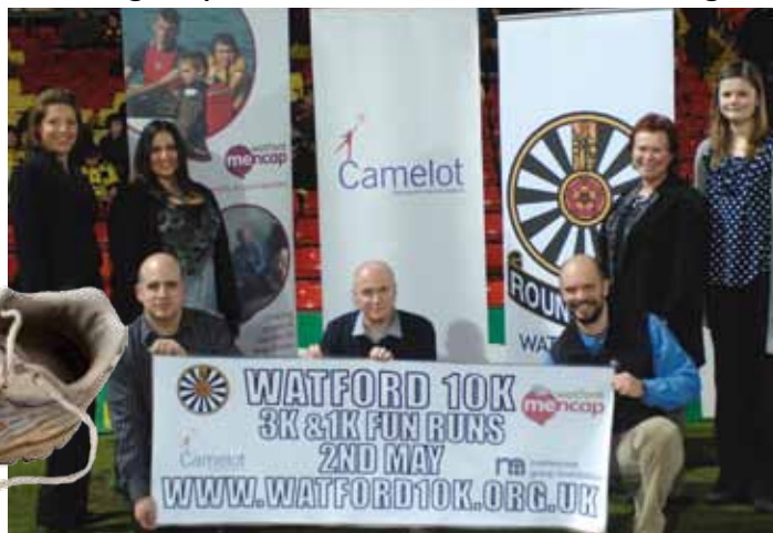
Sponsors and organisers launch the Watford 10k race at Vicarage Road.

As well as the main race, we also have a 1k race for under 10's and a 3k race for under 15's. Sign up now at www.watford10k.org.uk