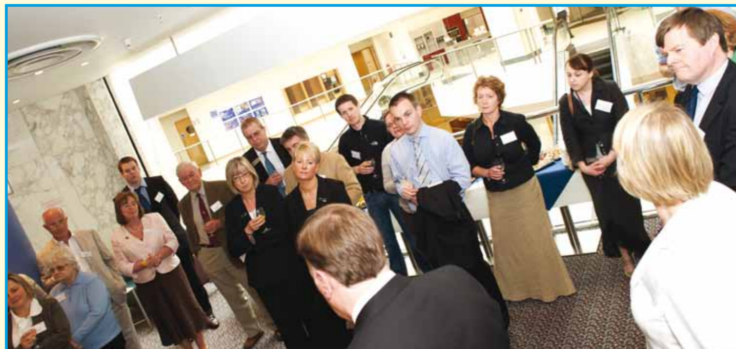
Local dignitaries and supporters attended the launch of Watford Mencap's case studies