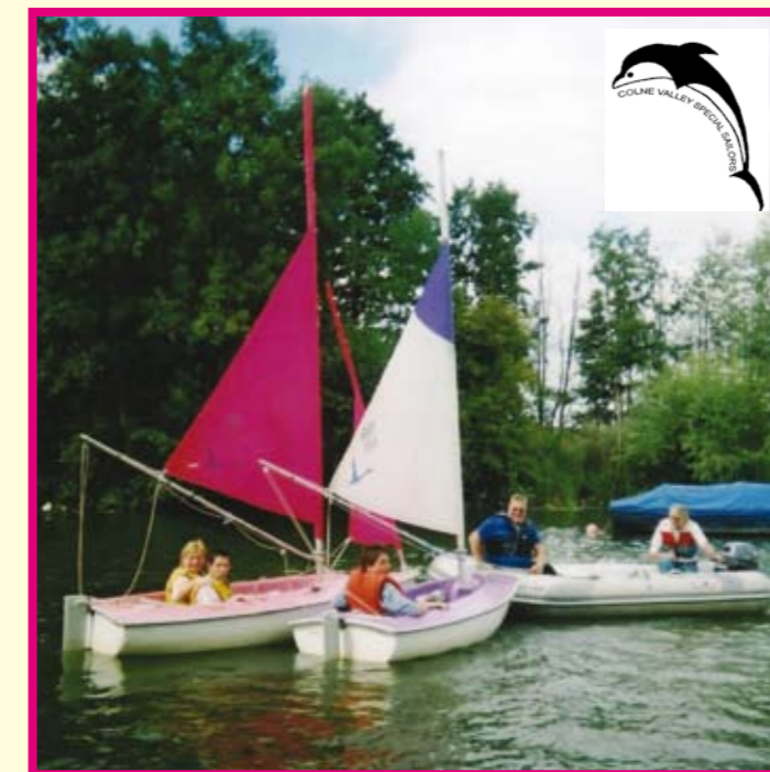
Come sailing with Colne Valley Special Sailors

The Colne Valley Special Sailors meet on Mondays, Wednesdays and Saturdays in the summer months at Rickmansworth Aquadrome.